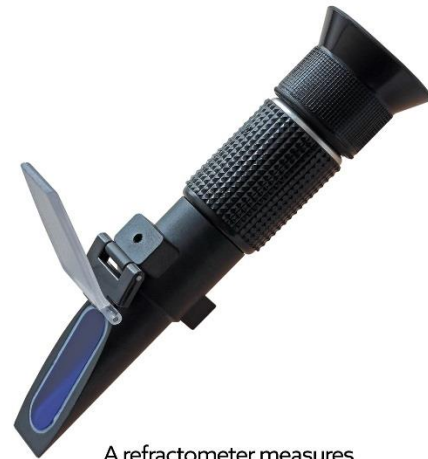
A refractometer measures the specific gravity (or the concentration) of the urine.

Renal disease is usually diagnosed by looking at the level of two biochemical byproducts in the bloodstream, blood urea nitrogen (BUN) and creatinine, in conjunction with the urine specific gravity (USpG). Microalbuminuria (or the presence of small protein molecules in the urine) is another indicator of CRF. Tests to measure the blood levels of other substances such as proteins, potassium, phosphorus, and calcium, as well as the red and white blood cell counts are important in order to determine the extent of kidney failure and the best course of treatment.